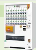
Vending machine with power-generator for emergency purpose

Sanden has also been an industry leader in providing equipment maintenance and renovation services that customers require in connection with their store network expansion and store rebuilding strategies.