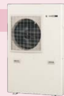
CO 2 heat-pump-type hot water supply for room heating unit

To help create comfortable living environments and promote energy conservation, we are using heat-pump technologies to develop and manufacture such products as Eco Cute* and other room heating systems. In this way, Sanden is increasing the application of its advanced technologies in the home as a foundation of our lifestyles.